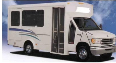
Mini bus, accessible