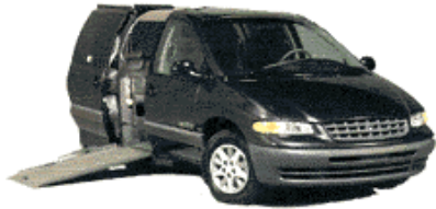
Lowered-floor Mini Van