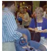
CPS Track Meet and Greet Manufacturers