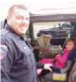
CPS for Law Enforcement