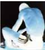
Life of an Athlete: Alcohol's impact on the body and its implications for high school athletes