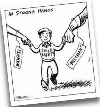
WAWHSL message from 1978

3:00-5:00 pm Wisconsin Association of Wo/Men Highway Safety Leaders (WAWHSL)