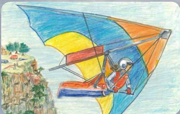
3rd Place Winner - Junior, USA

Once received, entries become (and remain) the property of the State Sponsor and may be used for a variety of purposes. Those forwarded for international judging become (and remain) the property of the Federation Aeronautique Internationale (FAI).