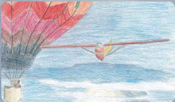
1st Place Winner - Junior, USA

Now, it's your turn to think about all the ways people travel through the sky with the power of the wind alone. Grab your favorite colored pens, pencils, or paint and create a poster celebrating the wonder that is Silent Flight.